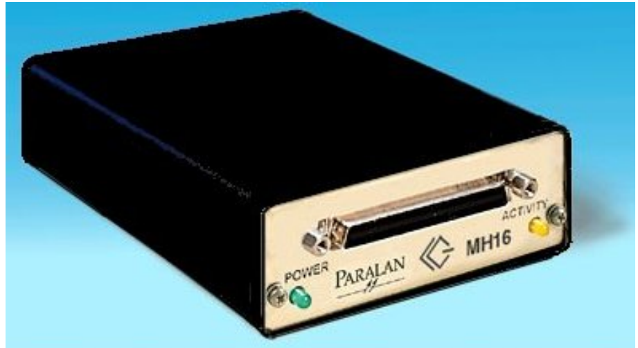
The stand-alone Model MH16A includes a power supply for standard power line operation