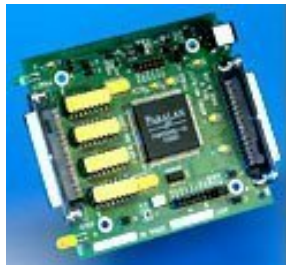
The board-level version Model MH17A is sized to fit in a standard 5.25" drive bay.

Quick Reference: Operation | Specs | Ordering Info